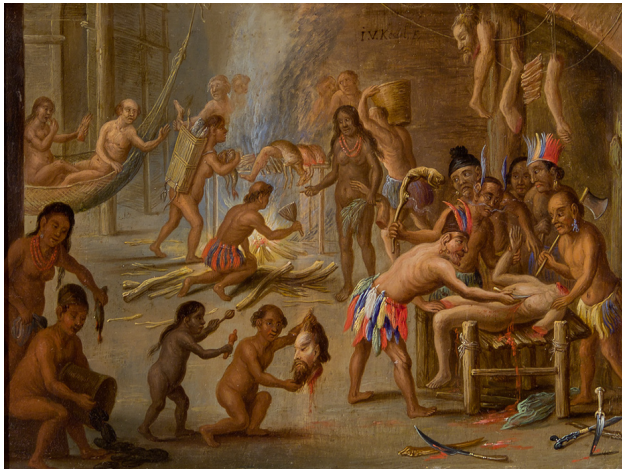
Musées d'Art et d'Histoire de La Rochelle

The use of new biomedical technologies has led to, among other factors, an increase in demand for health care. However, for economic, legal or ethical reasons, or due to human resources shortages, public health services in developed countries cannot respond to this growing demand, leaving the needs of some patients unmet.