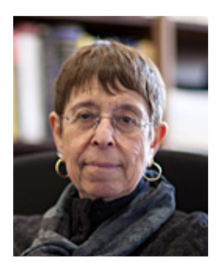
Ruth Macklin co-director of an NIH Fogarty International Center training program in research ethics USA